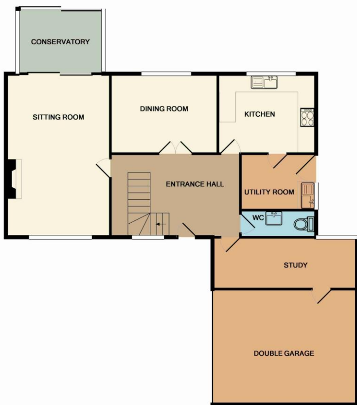
GROUND FLOOR APPROX. FLOOR AREA 111.6 SQ.M. (1201 SQ.FT.)