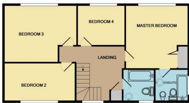
1ST FLOOR APPROX. FLOOR AREA 70.3 SQ.M. (757 SQ.FT.) TOTAL APPROX. FLOOR AREA 181.9 SQ.M. (1958 SQ.FT.)

Whilst every attempt has been made to ensure the accuracy of the floor plan contained here, measurements of doors, windows, rooms and any other items are approximate and no responsibility is taken for any error, omission, or mis-statement. This plan is for illustrative purposes only and should be used as such by any prospective purchaser. The services, systems and appliances shown have not been tested and no guarantee as to their operability or efficiency can be given. Made with Metropix ©2008