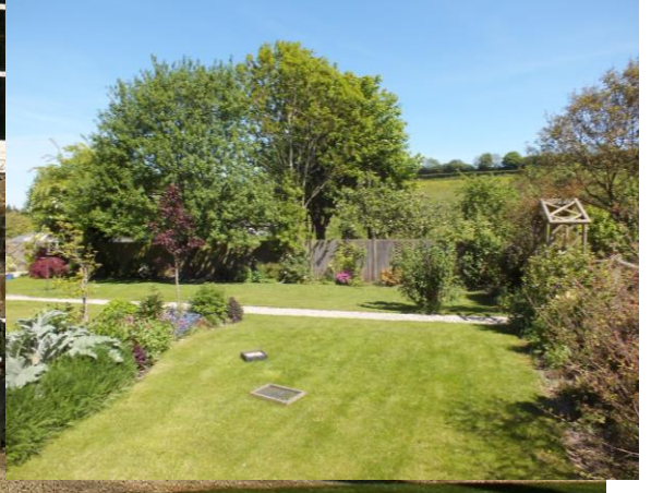
Test Place, Test Road, Test Area, SE9 £250,000 Freehold