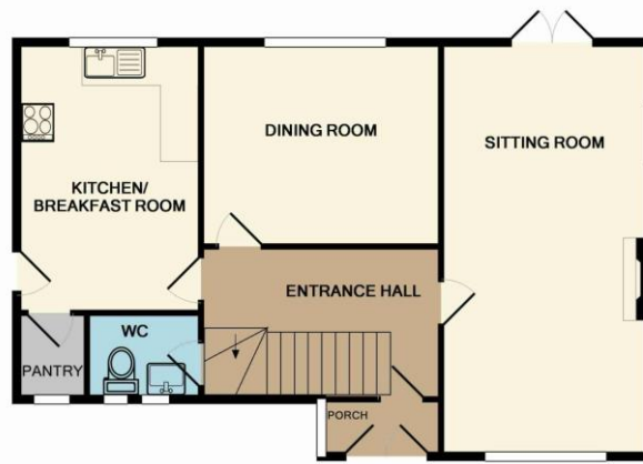
GROUND FLOOR APPROX. FLOOR AREA 62.3 SQ.M. (671 SQ.FT.)